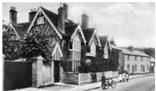
The Old House and cottages Church Street