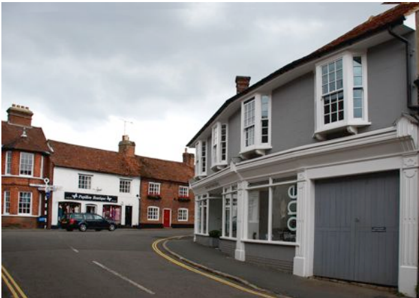
Church Street/High Street junction Great Missenden

Without a clear policy to promote retail and other businesses it is possible that the further loss of shops, in particular, will result in a vicious circle of reducing viability for those remaining and leave a less vital streetscape. This applies to Great Missenden High Street in particular, and the combined needs of both residents and visitors could help in its continued regeneration. The change of use of retail shops to other commercial and residential space does not support the revitalisation of the village centre.