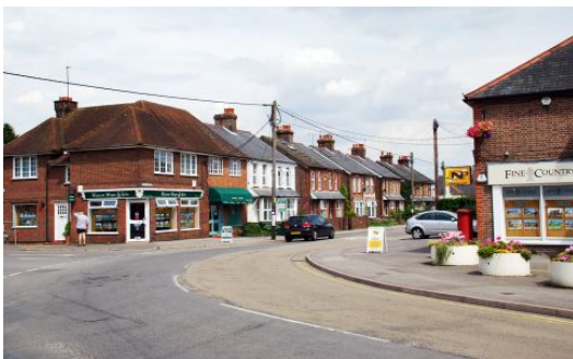
Chequers Corner, Prestwood