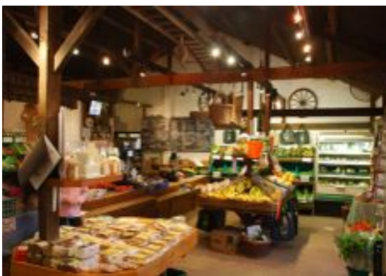
Peterley Manor Farm Shop, Prestwood

There are no manufacturing or production facilities of any significant scale.