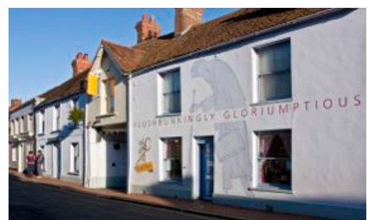
Roald Dahl Museum, Great Missenden

A visitors' centre needs to be established in Great Missenden to build on the success of the Roald Dahl Museum by encouraging visitors to visit the Conservation Area and the AONB, which would help the economic health of the villages.