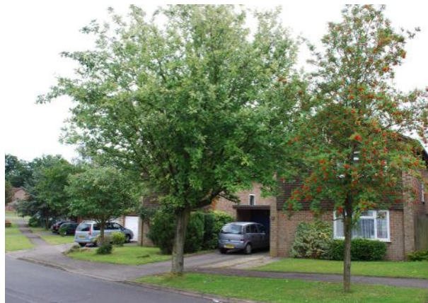
Example of soft landscaping

7.14 Landscaping is of particular importance and will help soften hard landscaping and integrate them into their surroundings