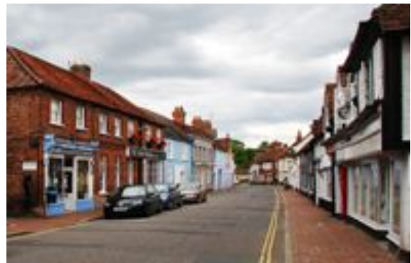
Great Missenden High Street

There are three schools in the village – a maintained secondary and primary school and a private preparatory school. There are playgroups and a nursery school.