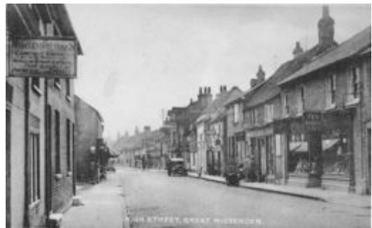
Great Missenden High Street

This was a first step towards becoming a borough. Burgage plots were laid out along the High Street and to this day the frontages of the houses to the north of The George reflect their original width. The Court House is the oldest secular building in the village located by The George, which also dates from this period. By this time, the coaching route between the Midlands and London had become important and the village grew as businesses were established to cater for travellers needs; the high entrances at the Dahl Museum and the George indicate their former roles as coaching inns. These businesses continued to develop until Victorian times when there were twelve inns along the High Street and in Church Street.