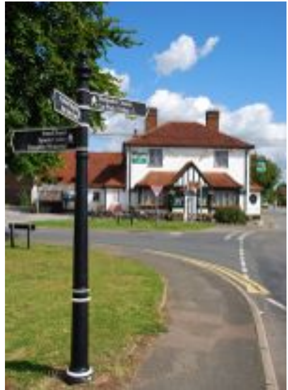
Chequers Public House Prestwood

The village has a diverse population of nearly 8,000 with the highest proportion of children and young people in the Chiltern district. Many residents travel elsewhere for their work, shopping, education, social and leisure activities. This daily exodus, coupled with the significant rise in the population with the building of Wrights Lane in the 1960s and the Lodge Lane estate in the 70's, means that Prestwood struggles to impart a distinct identity. This large increase in population has not been matched by an equivalent degree of investment in infrastructure and improvements in community facilities.