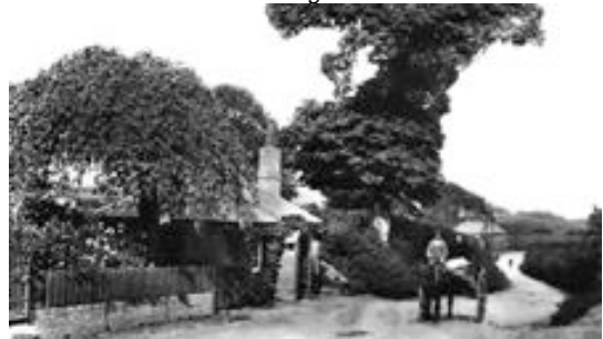
Old Toll House