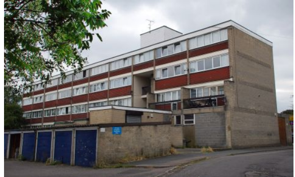
Hazell Road, Prestwood

Prestwood, having grown from a few houses around the Common, is now a large village (possibly the largest in England) in the Chilterns AONB. It has not had the benefit of either a coherent development plan in recent times, or the natural evolution of a traditional village over the centuries. These guidelines are to ensure that the impact of future development is minimised: