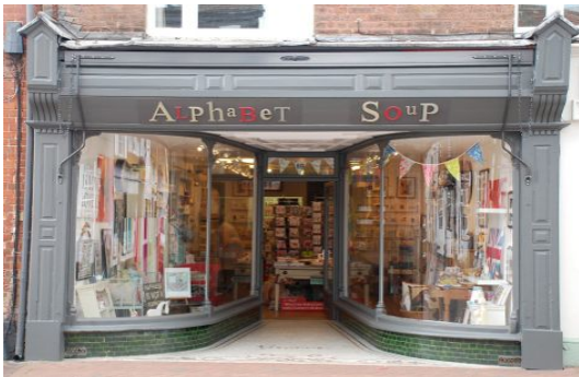
High Street Shop, Great Missenden

A high proportion of the working population travel out of the area to work and many now work from home; thus the high prosperity of the area has little relationship to the local economy.