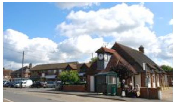
Prestwood Village Hall