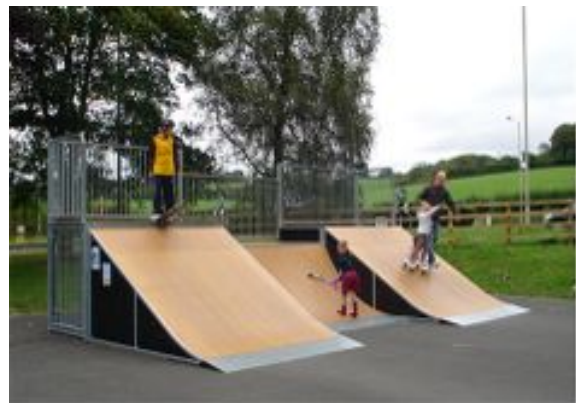
Great Missenden Skate Park