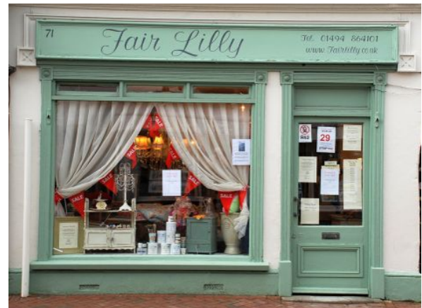
High Street Shop. Great Missenden

The other settlements within the Parish have different problems with regard to the provision of retail space.