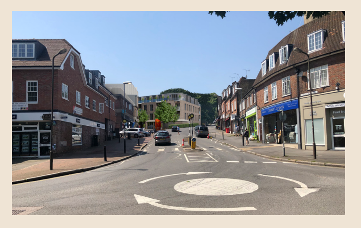
Proposed view west up Station Approach.