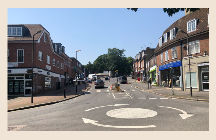
Existing view west up Station Approach.

The site is currently made up of the existing access road, roundabout and a commercial car sales business and a small taxi rank.