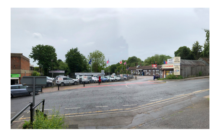
Existing view south from the old telephone exchange building towards station.