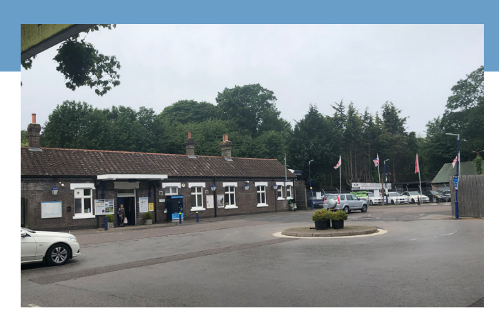
Existing view north-west towards train station.

Overall, the site is highly accessible and provides a great opportunity to improve the appearance of the area around the station and better represent the high quality of Great Missenden village.