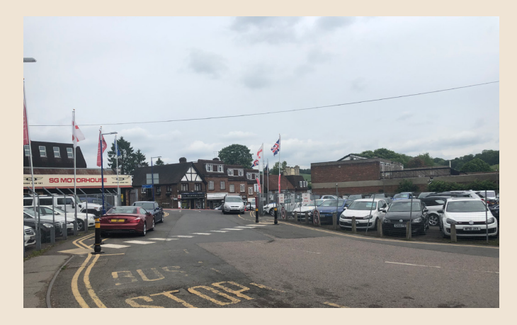
View north-east from train station towards Station Approach.