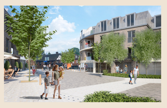
Proposed view north-east from train station towards Station Approach.