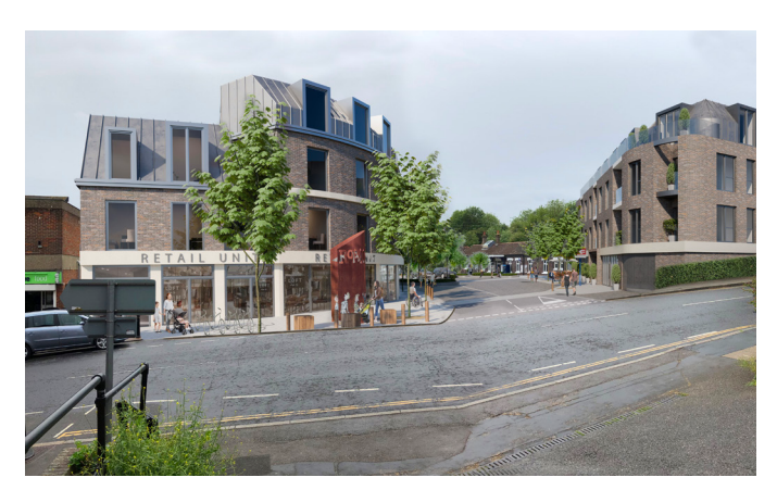
Proposed view south from the old telephone exchange building towards station.